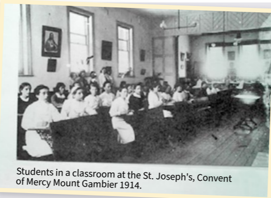
Students in a classroom at the St. Joseph's, Convent of Mercy Mount Gambier 1914.

Celebrating with gratitude and hope-filled excitement for the future.