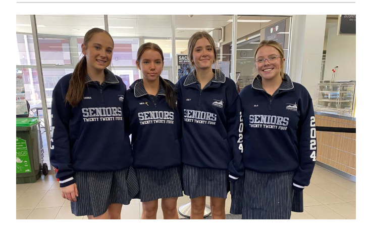
Year 12 Jumpers Have Arrived!