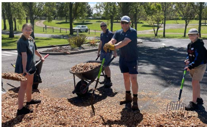
One of our 2023 Working Bees - fun for the whole family!

Please bring any gardening equipment you think could be of use: gloves, shovel, rakes, wheelbarrow, even your ute. Morning tea and refreshments will be supplied with a BBQ available from 10.00am.