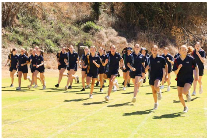
1500m 14yo Girls event held on Tuesday