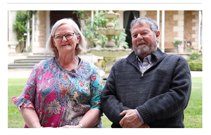
2023 Shining Light Awards Sneak Peek

Click here to watch a sneak peak of the 2023 Shining light award recipients.