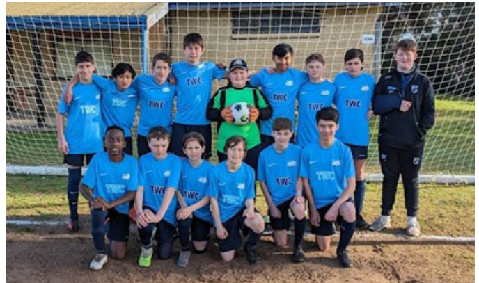
Year 7/8 Boys Soccer