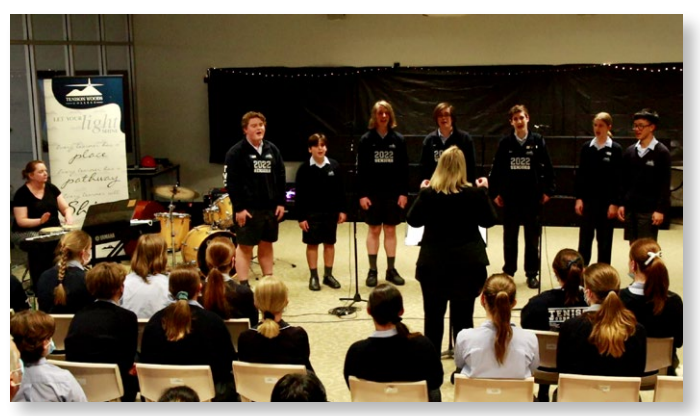
Senior Boys Ensemble