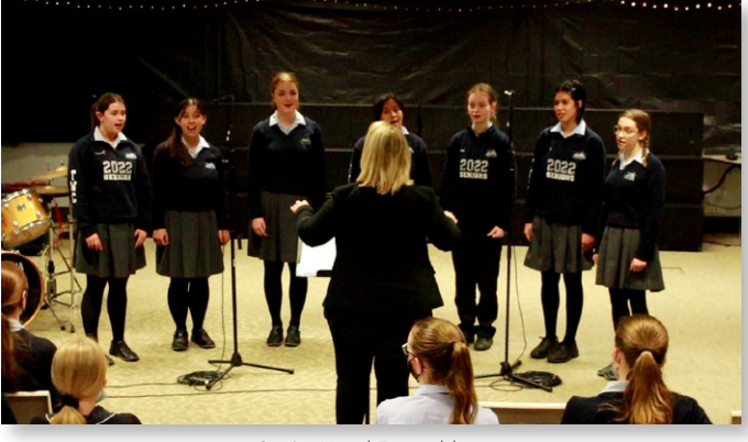
Senior Vocal Ensemble