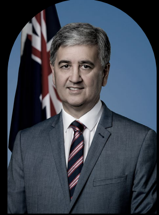
The Hon Rob Lucas MLC

ST. MARY'S (1959 - 1961) MARIST BROTHER'S AGRICULTURAL COLLEGE (1962 - 1969)