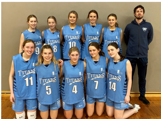
Girls Division B Basketball