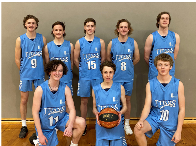
Boys Division B Basketball