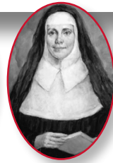
Venerable Catherine McAuley