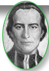
St Marcellin Champagnat