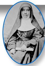
St Mary MacKillop