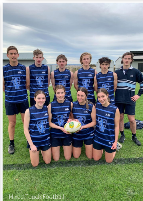
Mixed Touch Football