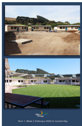
Term 1, Week 2 (February 2020) to Current Day