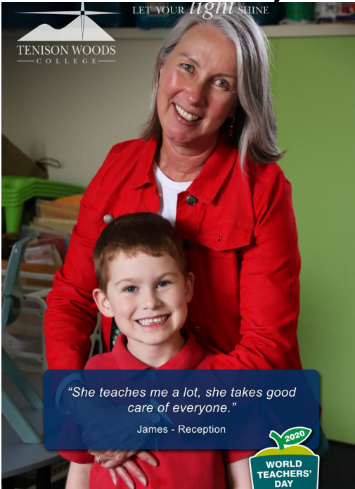
Photo Gallery - World Teacher Appreciation Day

"She teaches me a lot, she takes good care of everyone."