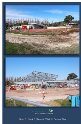
Term 3, Week 8 (August 2020) to Current Day