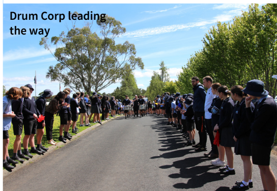
Drum Corp leading the way