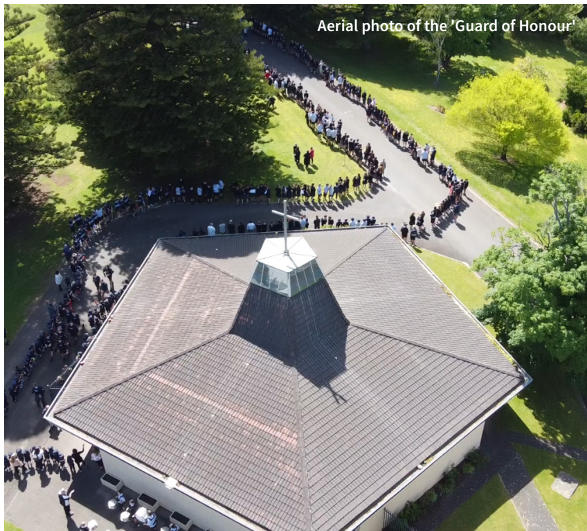
Aerial photo of the 'Guard of Honour'