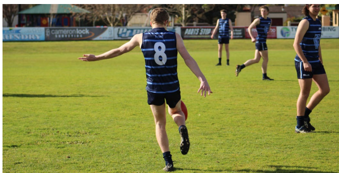
Photo Gallery - Open and 8/9 Sports