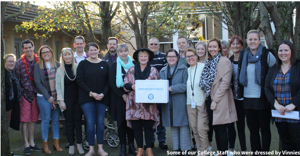
Some of our College Staff who were dressed by Vinnies