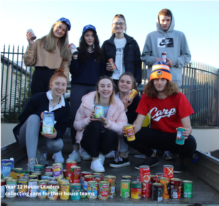
Year 12 House Leaders collecting cans for their house teams