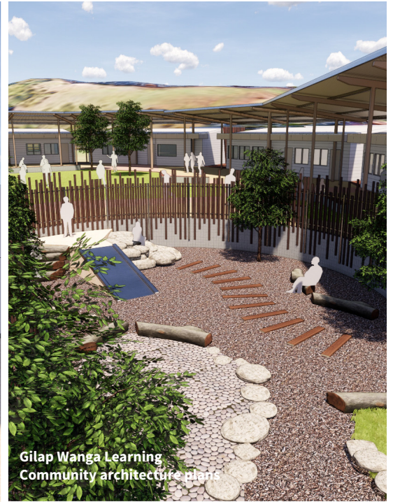
Gilap Wanga Learning Community architecture plans