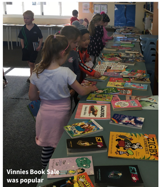
Vinnies Book Sale was popular