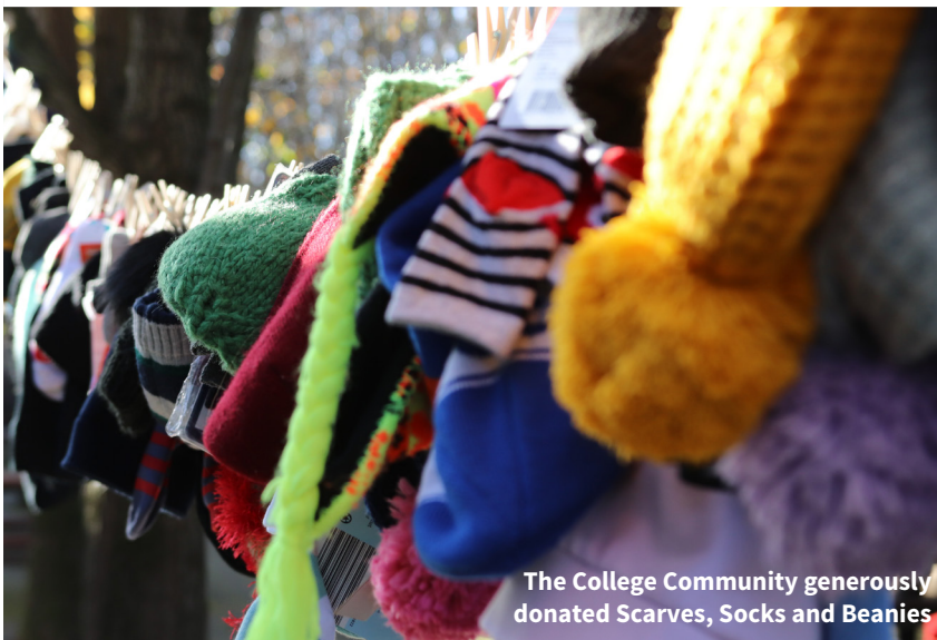
The College Community generously donated Scarves, Socks and Beanies