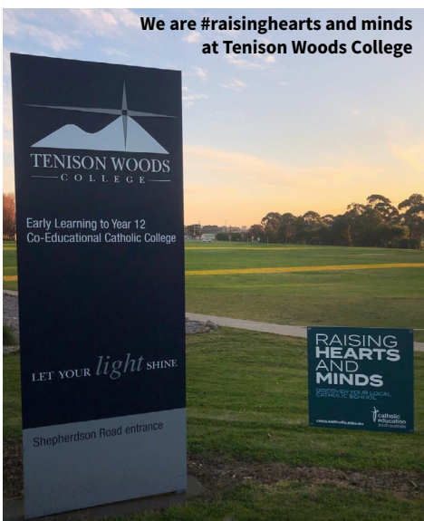
We are #raisinghearts and minds at Tenison Woods College