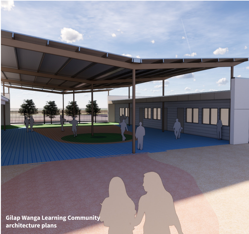
Gilap Wanga Learning Community architecture plans