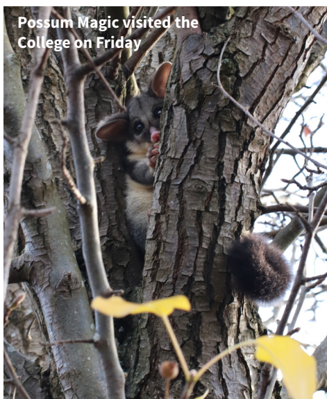
Possum Magic visited the College on Friday