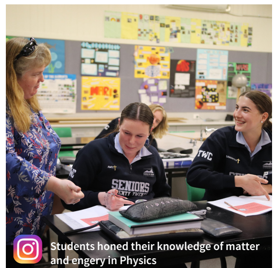
Students honed their knowledge of matter and energy in Physics