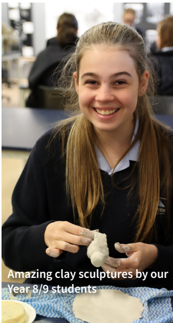
Amazing clay sculptures by our Year 8/9 students