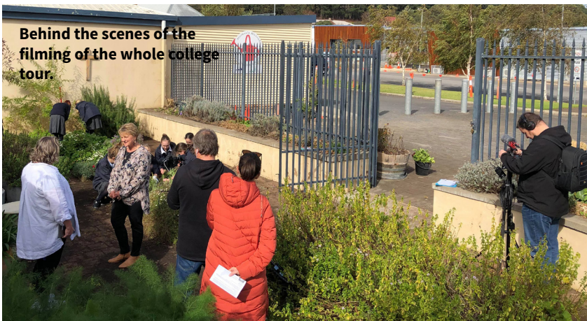
Behind the scenes of the filming of the whole college tour.