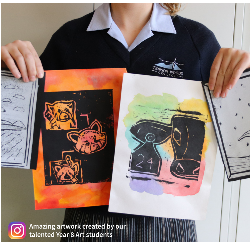
Amazing artwork created by our talented Year 8 Art students