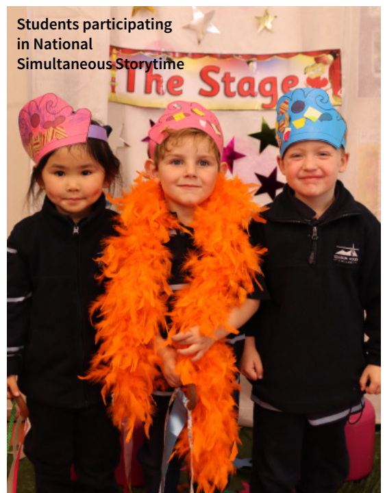
Students participating in National Simultaneous Storytime