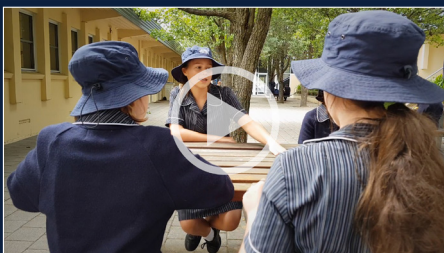
View 'A Day in the life of a Middle School Student' Video