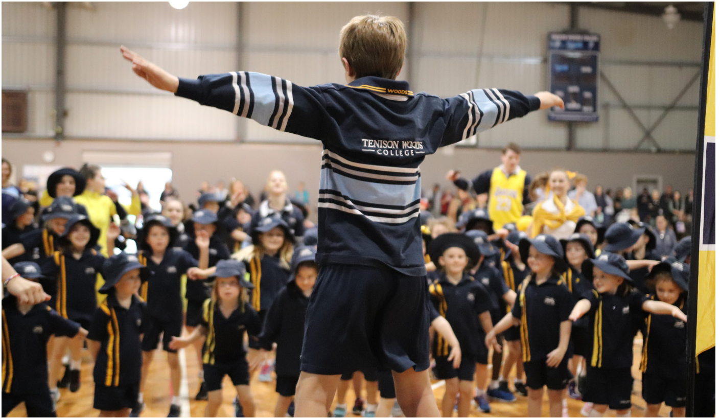
Photo Gallery - Reception-2 Sports Day