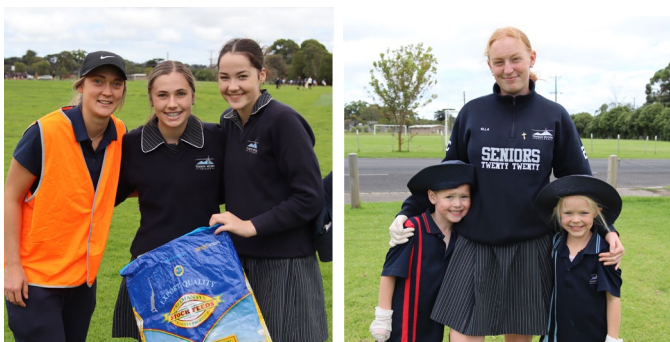
Photo Gallery - Clean Up Australia Schools Day