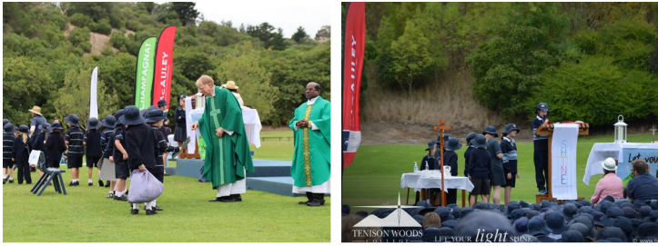
Photo Gallery - Whole School Mass