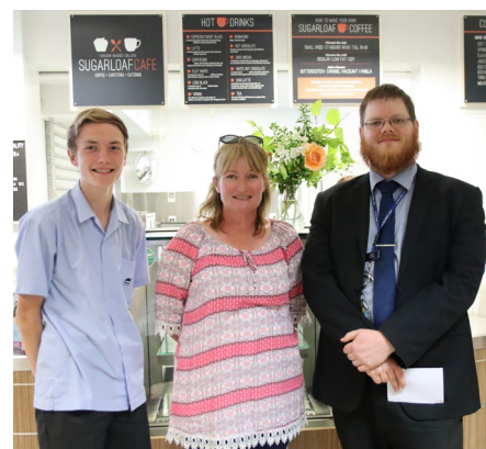
Welcome and Community Gathering

Please view reports about each of the above events later on in the Newsletter.