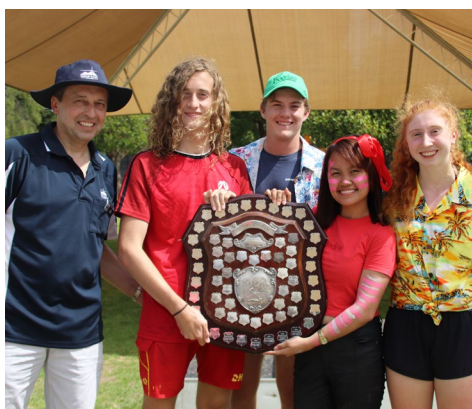
Year 8-12 Swimming Carnival