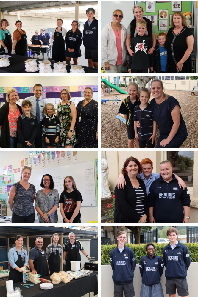
Photo Gallery - Welcome and Community Gathering