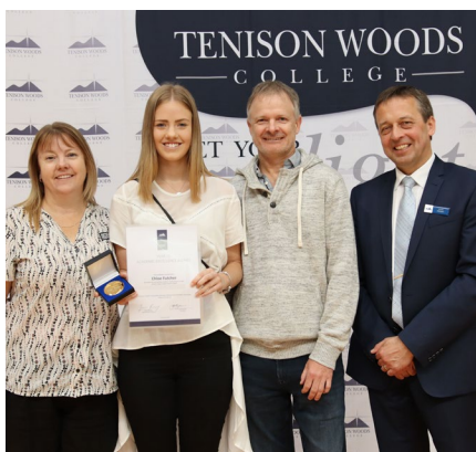
Dux and Academic Awards Ceremony