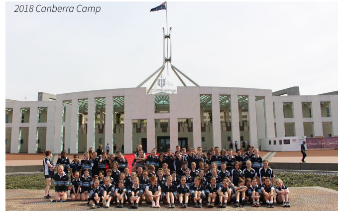
2018 Canberra Camp

This week saw the beginning of Year 12 SACE exams for our students. We wish them well over the next two weeks and offer them this prayer; Loving God, Be with the Year 12 students as they commence this exam period. Give them the confidence they need and allow them to demonstrate their many gifts. Give these students courage and the confidence to know that no matter what happens they are deeply loved and that all will be well. Amen.