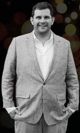
St Paul's / Tenison Woods College 1994 - 2006