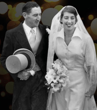
College Community Involvement 1933 - 1994