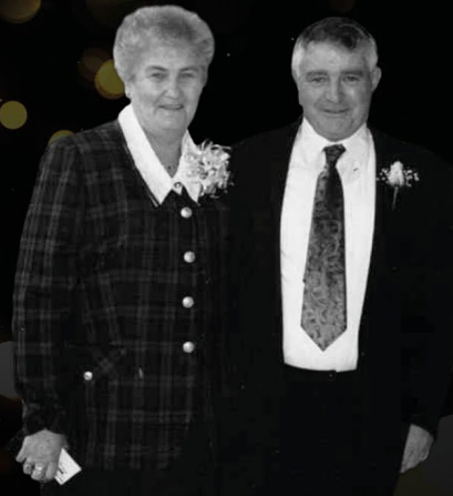
College Community Involvement 1942 - 1984