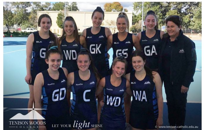
Year 10 Team