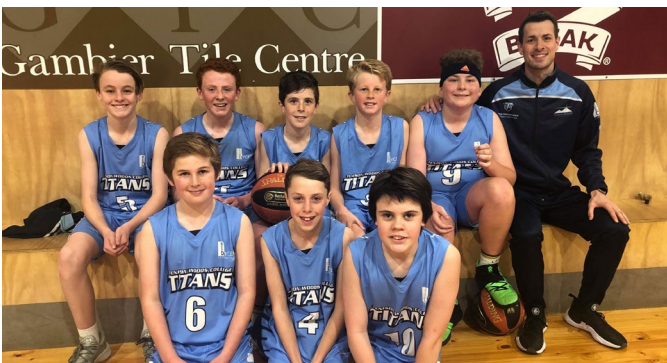
6/7 Boys Team