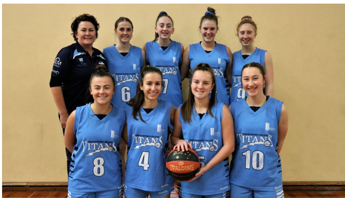
Open Girls Team