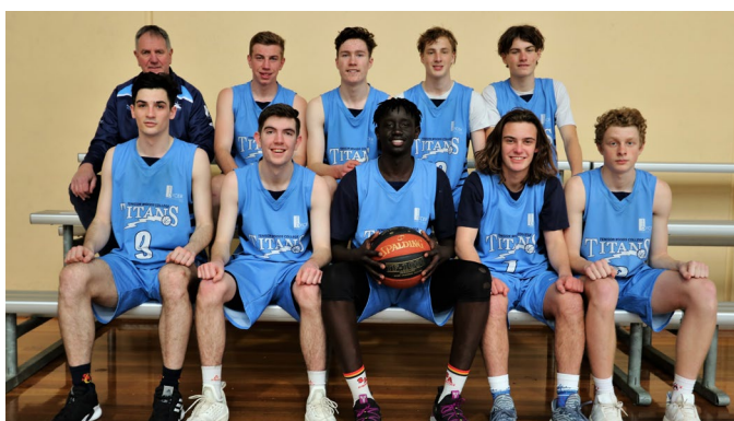
Open Boys Team