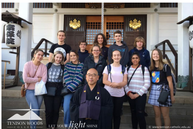
Japanese Immersion Students at a Buddhist Temple in Machida city after Zazen Meditation

A delegation of 12 students and 10 adults undertook a two week educational and cultural trip to Japan over the Easter holidays. The whole trip was amazing with a wide variety of undertakings and experiences which covered the broad timeline of ancient history through to the modern technology that Japan has to offer. We stayed in downtown Tokyo, with its busy neon lights and crushing crowds, through to the tranquil rural setting of the Eco-institute at Shirakawa-Go where we experienced the snow in the Japanese Alps and traditional Japanese outdoor cooking called Nabe, or ‘one pot cooking’.